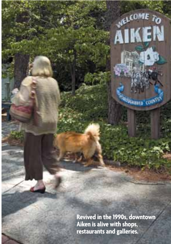
Revived in the 1990s, downtown Aiken is alive with shops, restaurants and galleries.

Aiken is in Aiken County, bisected by U.S. 1 and U.S. 78 and just off Interstate 20. It is about 50 miles from Columbia and 15 miles from Augusta, Ga.