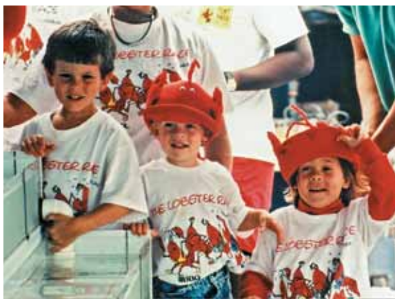
Aiken's lobster race has become an annual spring rite. Find out more about this year's race in our Highlights on page 6.

WHEN HOLLYWOOD hooper Fred Astaire would retrieve his mail at the Aiken post office, he would dance up and down the stairs, to the gathered crowd's delight.