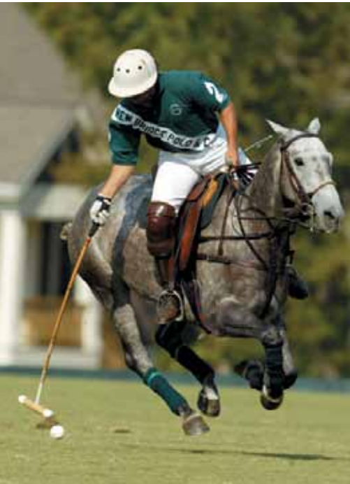
Farms, races and polo tournaments keep horses in the center of Aiken life.

Whether you're planning vacation travel by train, RV or automobile, keep these places and events in mind for the best spring and summer fun. Use the handy Reader Reply coupon on page 31 to get more information on these advertisers.